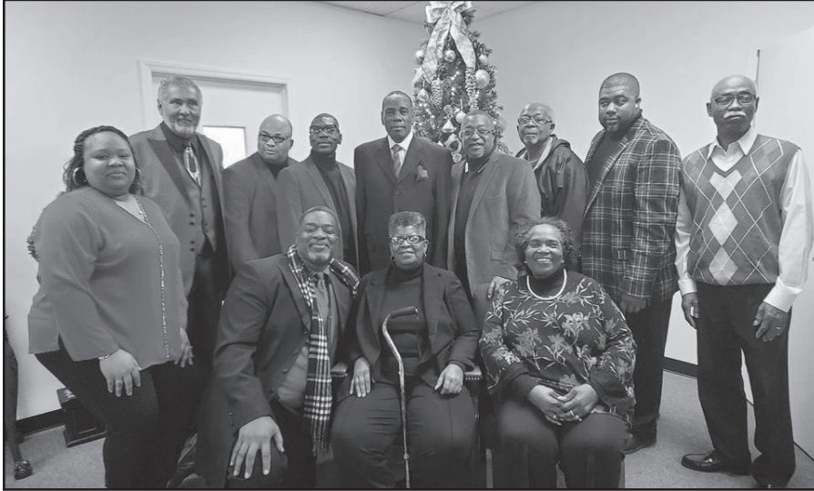
Hunter-Odom Funeral Services Staff and Directors