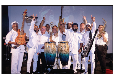
LET'S GROOVE TONIGHT