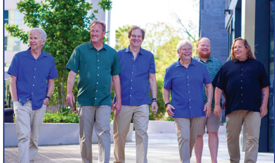
NORTH TOWER BAND